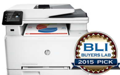
Hewlett-Packard Company Color LaserJet Pro MFP M277dw Outstanding SOHO Colour MFP