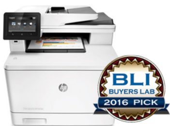
HP Inc. Color LaserJet Pro MFP M477 Series Outstanding Colour MFP for Small Workgroups