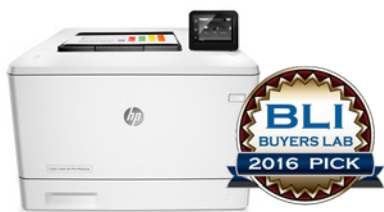
HP Inc. Color LaserJet Pro M452 Series Outstanding Colour Printer for Small Workgroups