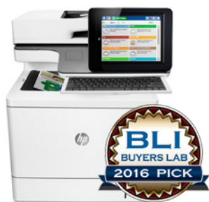
HP Inc. LaserJet Enterprise MFP M577 Series Outstanding Colour MFP for Large Workgroups

Professional-quality documents without the wait