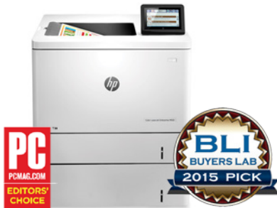
HP CLJ Enterprise M553 series Hewlett-Packard Company Color LaserJet Enterprise M553 Series Outstanding Colour Printer for Mid-Size to Large Workgroups