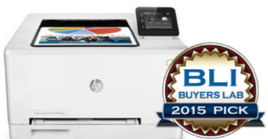
Hewlett-Packard Company Color LaserJet Pro M252dw Outstanding SOHO Colour Printer